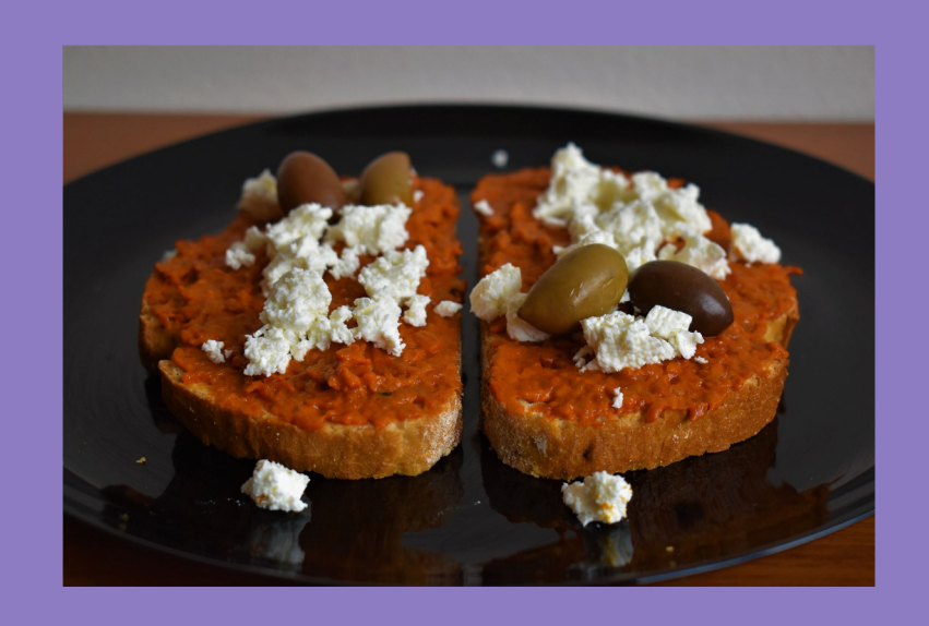
Share lazy weekend breakfasts