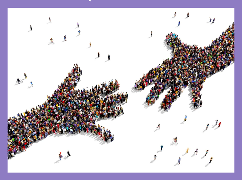
But...feel like we have lost the connection